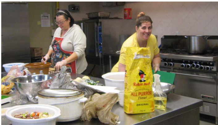
Participants in community kitchen at St. John's.

Your generous gift through Hands Across Niagara makes a difference in our region, across Canada, and around the world.