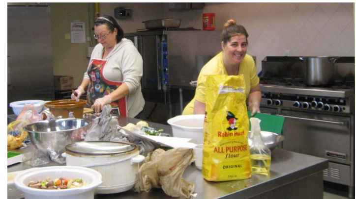
Participants in community kitchen at St. John's.

Your generous gift through Hands Across Niagara makes a difference in our region, across Canada, and around the world.